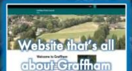
Website that's all about Graffham