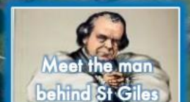
Meet the man behind St Giles