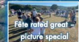
Fête rated great - picture special