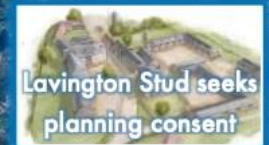
Lavington Stud seeks planning consent