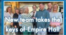
New team takes the keys of Empire Hall

Eight pages of reports and analysis in this bumper edition